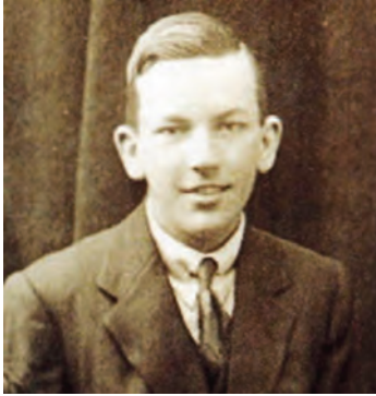
Noël Coward in his teens

Sir Noël Peirce Coward (16 December 1899 – 26 March 1973) was an English playwright, composer, director, actor and singer, known for his wit, flamboyance, and what Time magazine called “a sense of personal style, a combination of cheek and chic, pose and poise”.